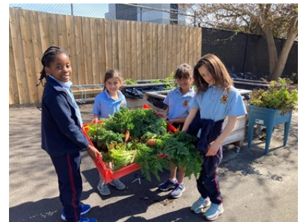
Enjoying the vegetable garden