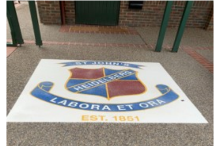
Our new entry

Dear Lord, At this time of pandemic, Let us foster respect and solidarity with others, especially those who are weak or poor. Let us remain calm and ignore unsubstantiated rumours. Let us take advantage of living together as a family. Let us attend to moments of prayer. Let us cultivate responsibility, patience and hope. Lord Hear Us. Amen.